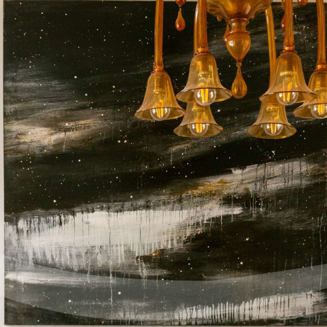
Alessandro Spadari - Luci e stelle