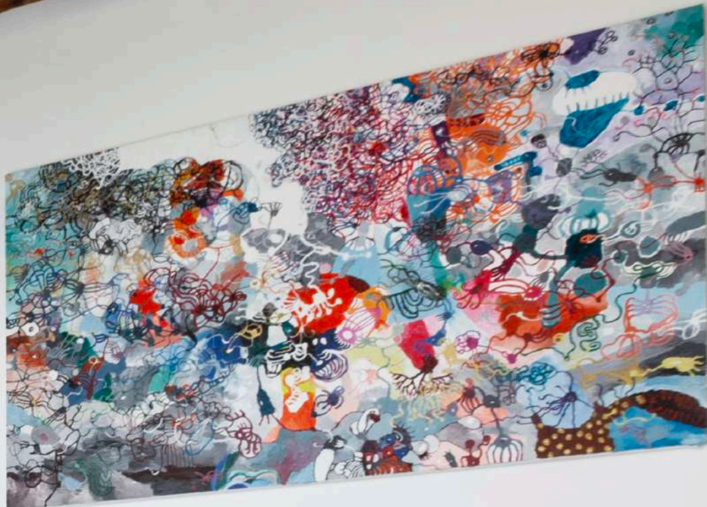
Francesco Tricarico - Senza titolo