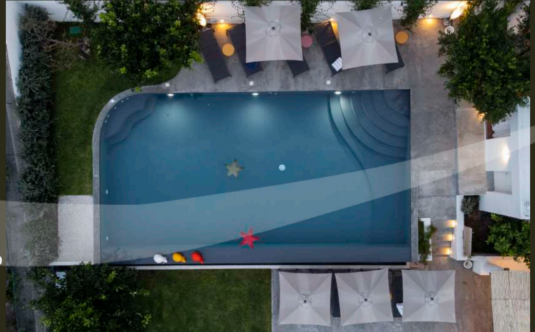
Cracking Art - Chioccioline